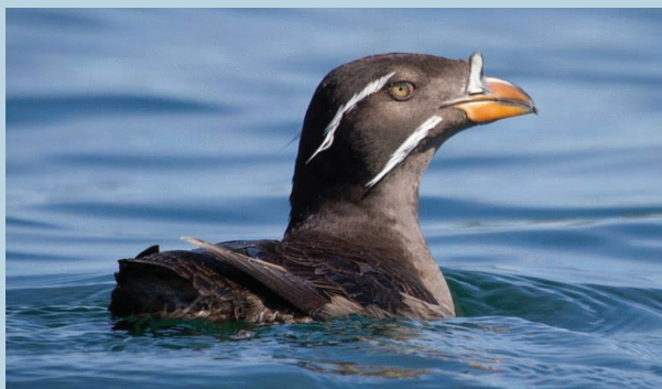
Rhinoceros Auklet, M.Martel

The Victoria Harbour Migratory Bird Sanctuary features 1840 hectares of shores, beaches, waters and islands with beds of clams, eelgrass, kelp forests, tidal marshes, six small estuaries, maritime meadows and rare Garry Oak ecosystems. It is associated with three B.C. Ecological Reserves, seven Key Biodiversity Areas and the Chain Islets Important Bird Area.